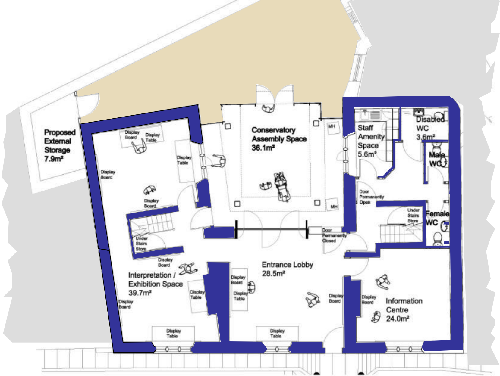
WHS Visitor Gateway Preliminary Ground Floor Plan